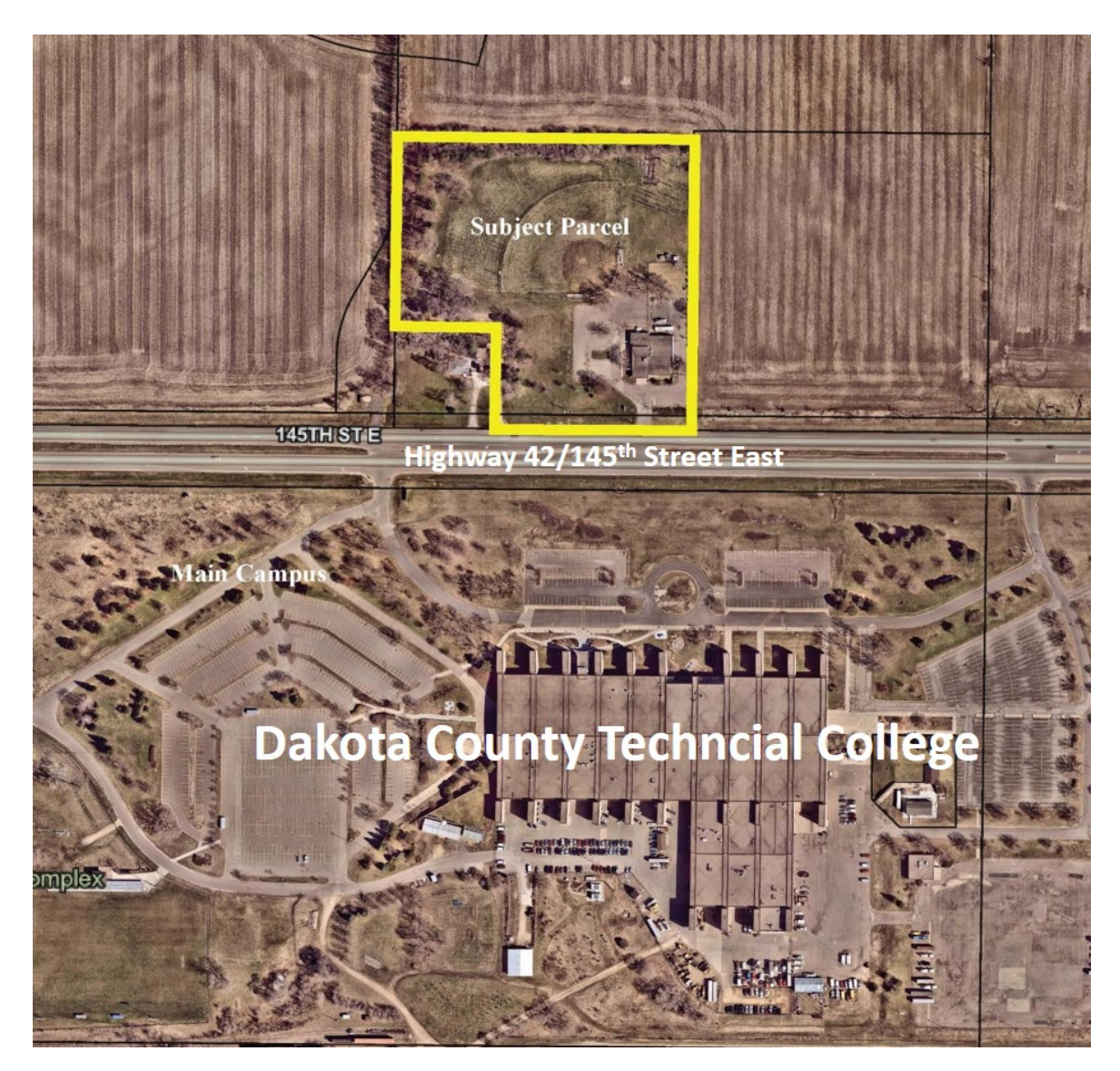
Dakota County Technical College Surplus Property Request.