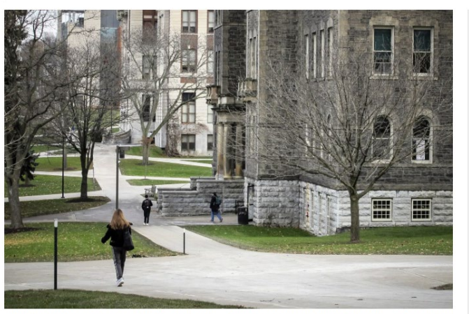
Syracuse University is among the dozens of schools in the United States that use tracking systems to monitor students' academic performance, analyze their conduct or assess their mental health.

Colleges are turning students' phones into surveillance machines, tracking the locations of hundreds of thousands