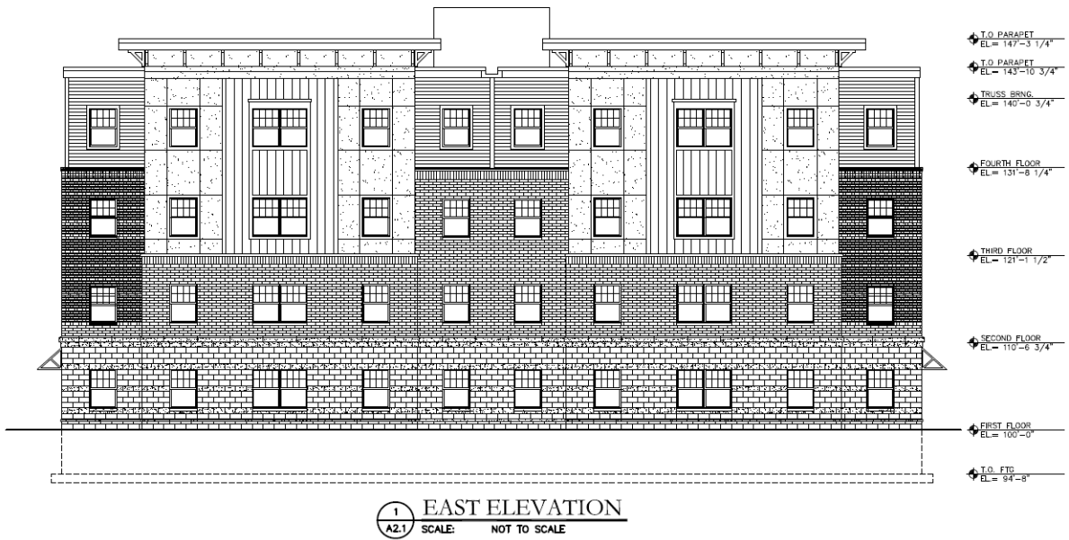
Figure 2: Project Elevation