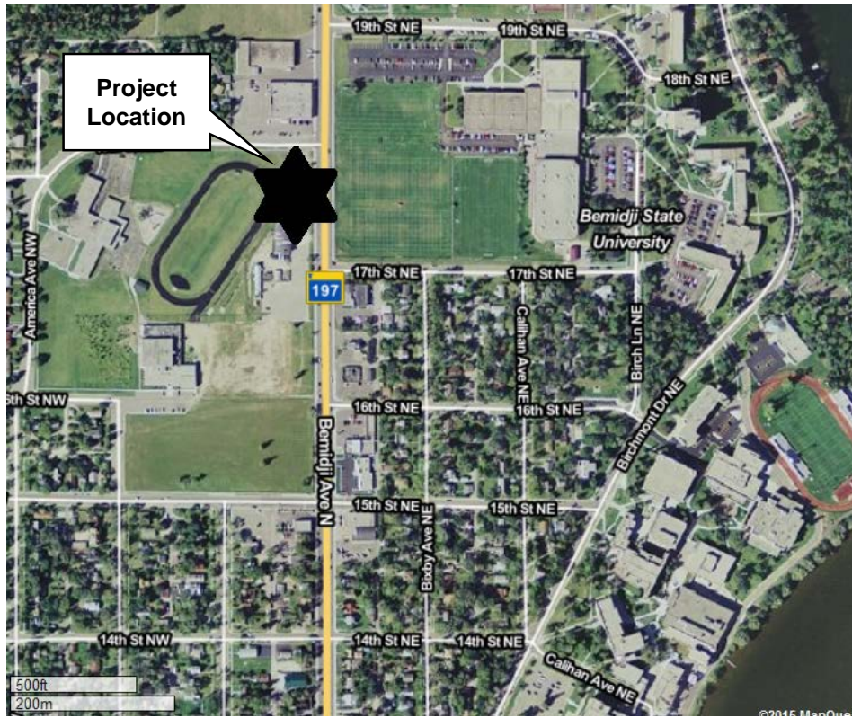
Figure 1: Project Site Plan